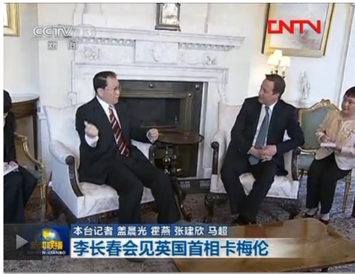
PM Cameron & Mr Li Changchun, Politburo.