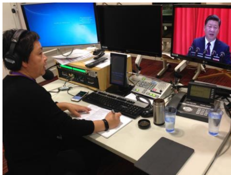
BBC Remote Live Interpreting for President Xi, the 19th National Congress (18 Oct 17)