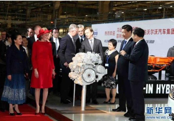
President Xi and King Phillip of Belgium.